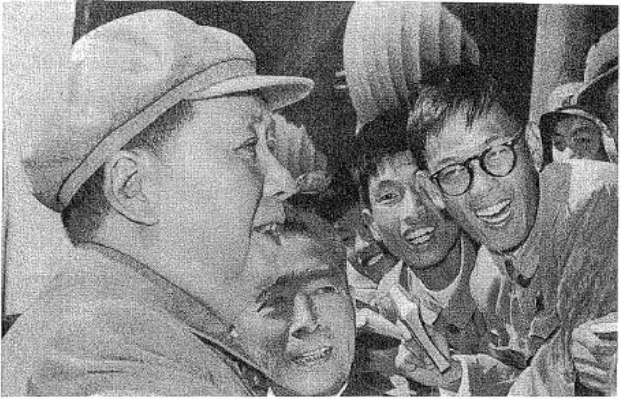
Mao Tse-Tung and Chou En-Lai greet students in Peking.

Constraints on the achievement of such goals are serious for the PRC. Mao would like to consider China's huge population as an asset, a vast reservoir of selfless dedication, inexhaustible ingenuity, and unlimited productivity. But the population is a problem in more ways than one. To the basic question of how to feed so many mouths is added the overwhelming task of governing 800 million people—a task unprecedented in world history. Thus Peking faces bureaucratic complexity, regional self-interest, and mass human inertia as factors intervening between the formulation of a directive at Party Central and its modified implementation at the grassroots in the provinces. Such constraints operate in different ways and to varying degrees on internal and external policy.